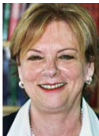
Dorit Beinisch (born 1942) President of the Supreme Court of Israel