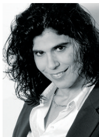
Yael Arad (born 1967) First Israeli to win an Olympic medal