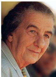
Golda Meir (1898 -1978) Fourth Prime Minister of the State of Israel