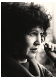
Dahlia Ravikovitch (1936-2005) Israeli poet and novelist