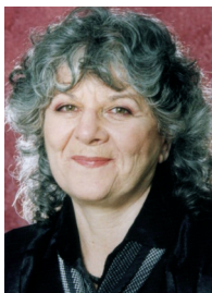
Ada Yonath (born 1939) Israeli scientist