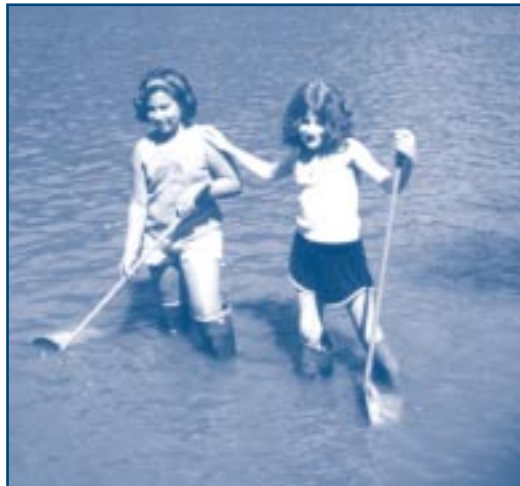
Fishing at Eagle Bluff Environmental Learning Center.