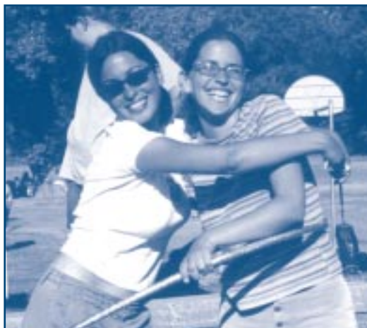
Israeli shlichim try the hula hoop together.

Session 2 Jewish overnight camp experience, July 28 – August 1