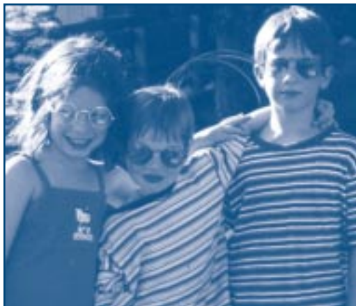
Campers relaxing by the pool and looking cool in their shades.

Ruach means “spirit” in Hebrew. Our Ruach campers are the spirit and soul of Camp Olami. Each busy day in Ruach, campers explore arts, sports, nature, Judaica and more. New opportunities and challenges abound, from learning a new stroke in the pool to sleeping away from home for the first time on a special overnight.