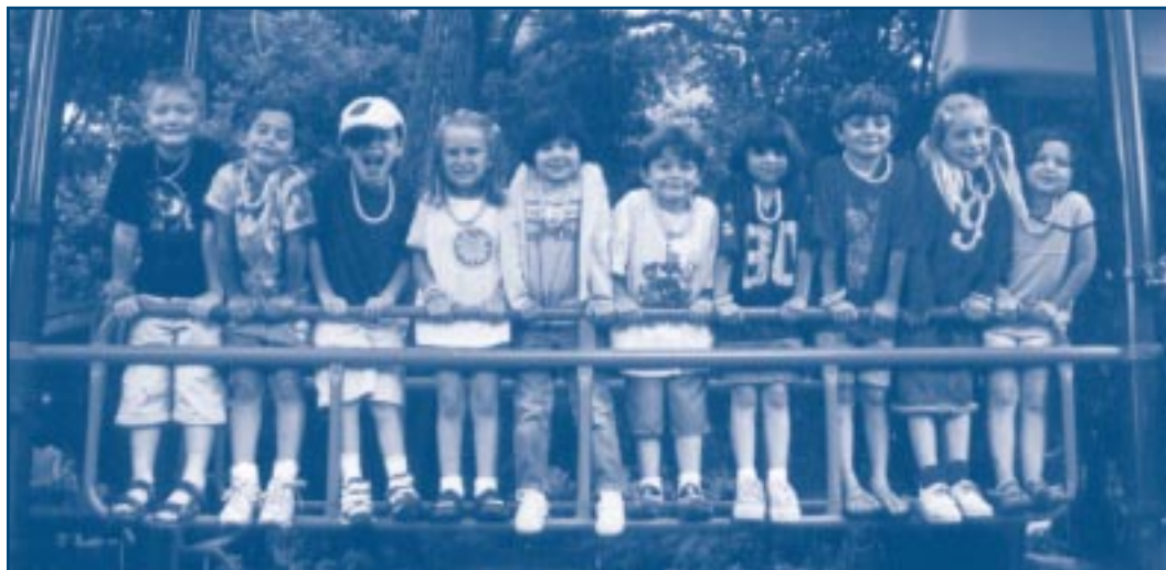
Yomi campers on the bridge.