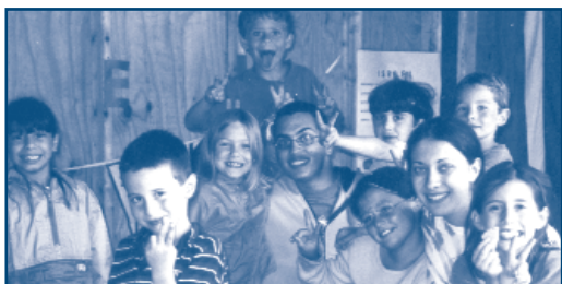
A wish for peace.